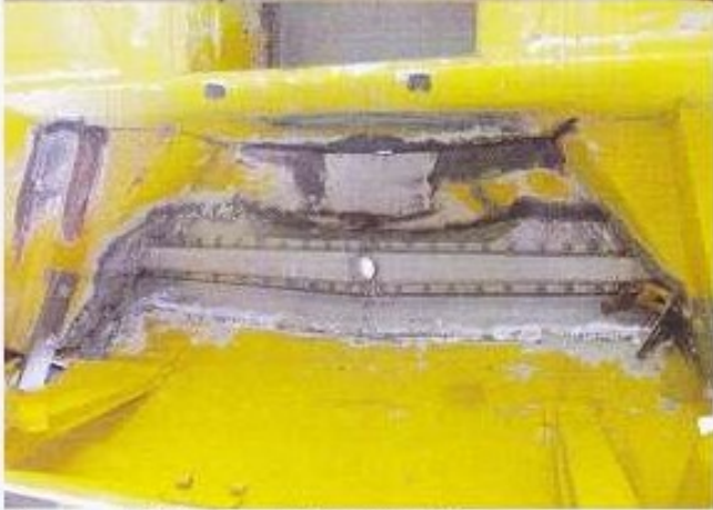
Homemade inner and outer sills