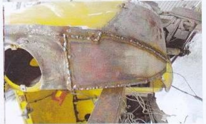
New made panel And replaced Made up door frame Part 2 to Come.