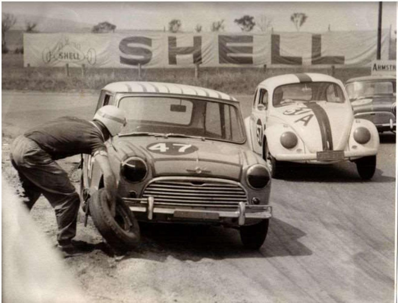
The real Bathurst racing, no plastic here.

XXXXXXXXXXXXXXXXXXXXXXXXXXXXXXXXXXXXXXXXXXXXXXXXXXXX