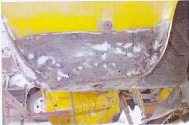
Back right quarter with boggy removed