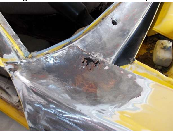
Top of Right Mudguard

They say A Picture is Worth a Thousand Words so I thought the Pictures can tell this story.