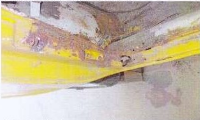
Cut out rusty door post and make up new panels