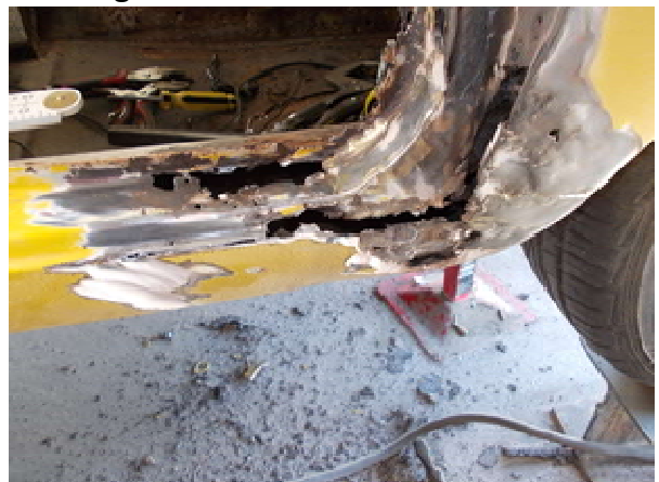
Bogged over RUST.