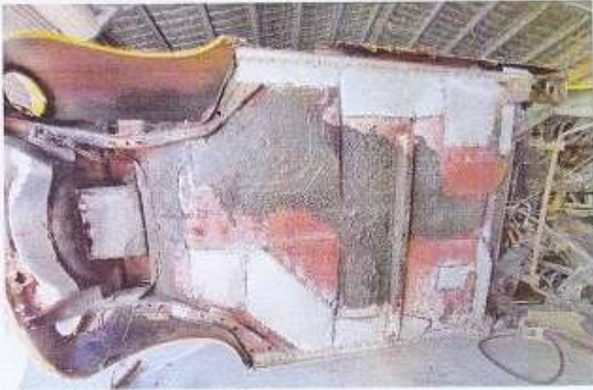
Replaced Floor panels