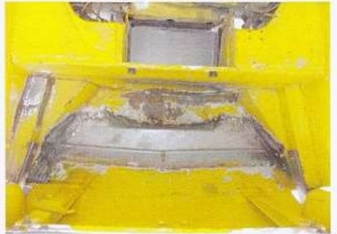
Replaced rusted spare wheel space and bracing