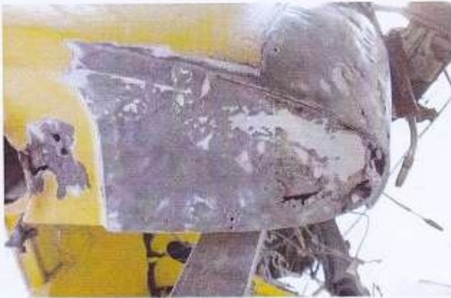
Under the right tail light