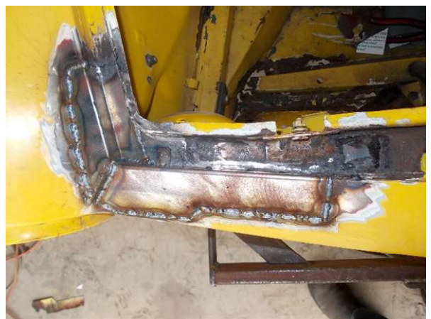
Front right but both sides the same